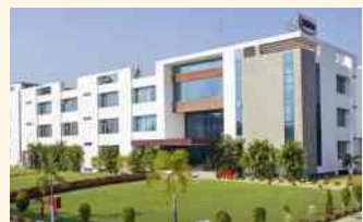
5 Min to MSN Labs