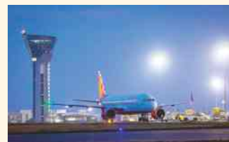
55 Min to International Airport