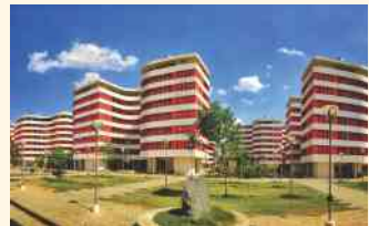
1 Min to IIT