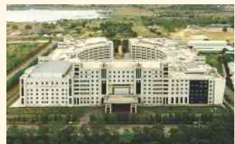
3 Min to GITAM