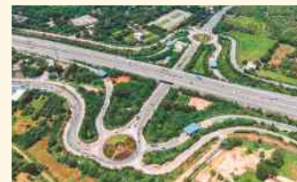
10 Min to ORR, Mutangi