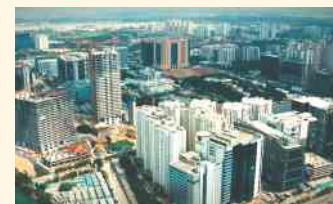
25 Min to Financial District