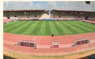
25 Min to Gachibowli Stadium