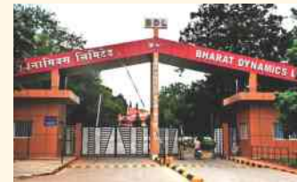
15 Min to BDL