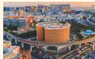
40 Min to Hi- Tech City