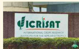
15 Min to ICRISAT