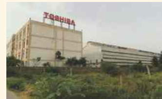
3 Min to TOSHIBA