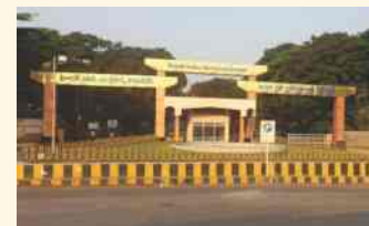
20 Min to BHEL Township